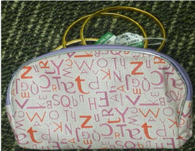
Pouch containing the 11 pieces of jewellery