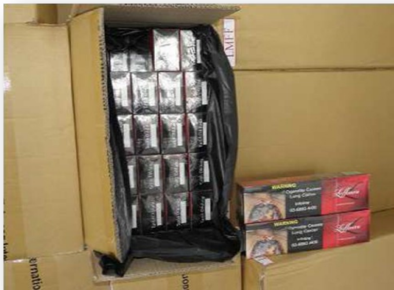
A total of 502,500 packets of cigarettes were seized in container arising from incorrect manifest declaration.