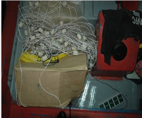
Under Blue Canvas Sheet Underneath the Fishing Net