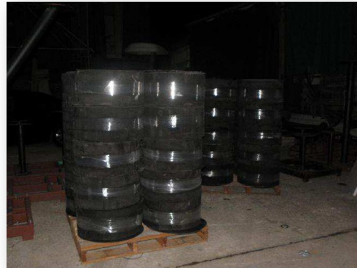
Lorry driver deposited six pallets of rubber drums at the back of the factory.