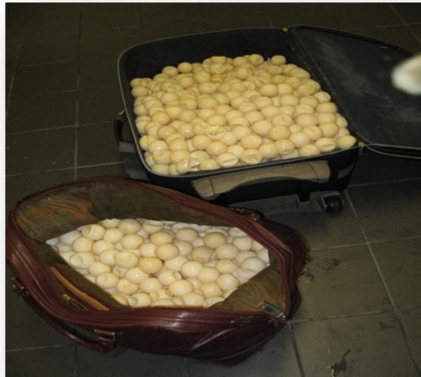
1520 Turtle Eggs Seized