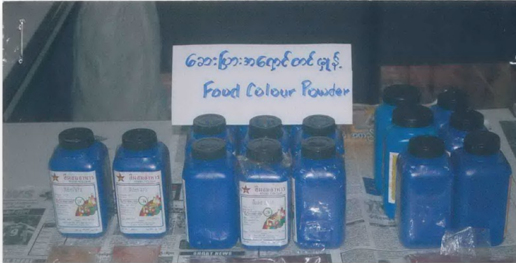
Food Colour Powder