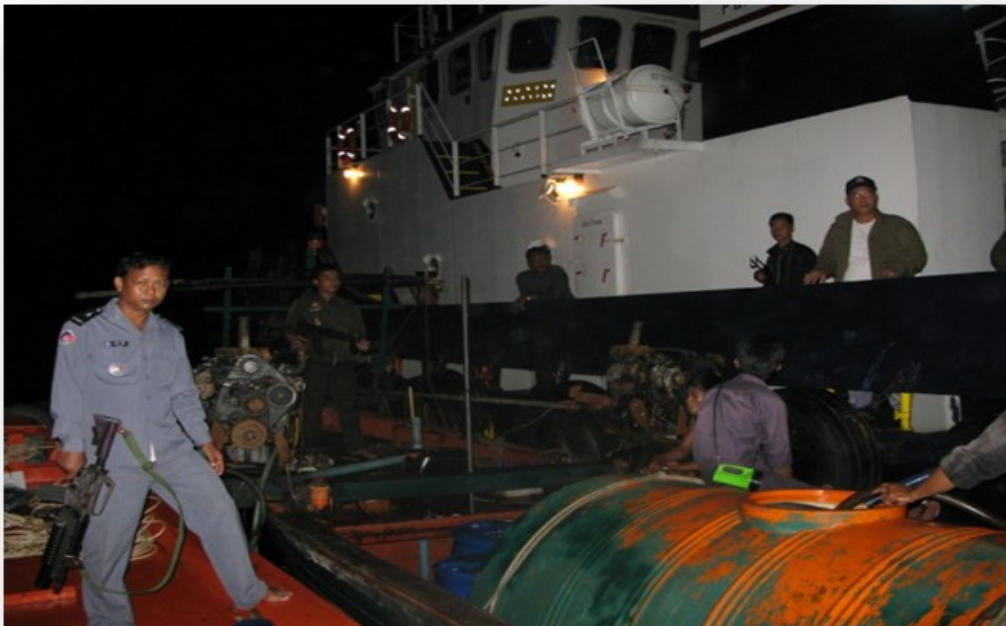
Cambodia Customs Marine Office seized the vessel and boat when they discharge illegally diesel from vessel to boat.