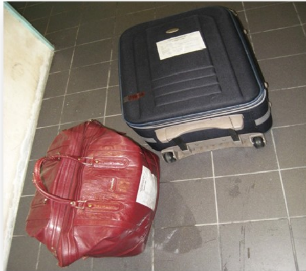
Conceal in Travel Luggage