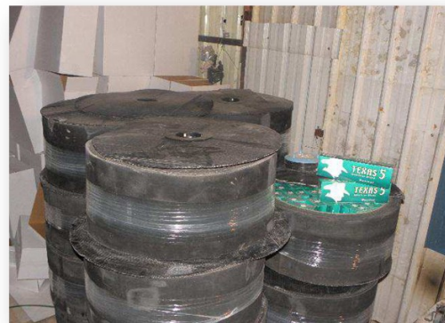
On removing the top layer, contraband cigarettes were uncovered.