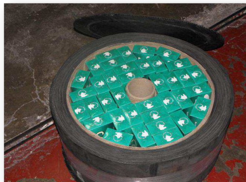
Every roll of rubber contained 37 cartons of contraband cigarettes.