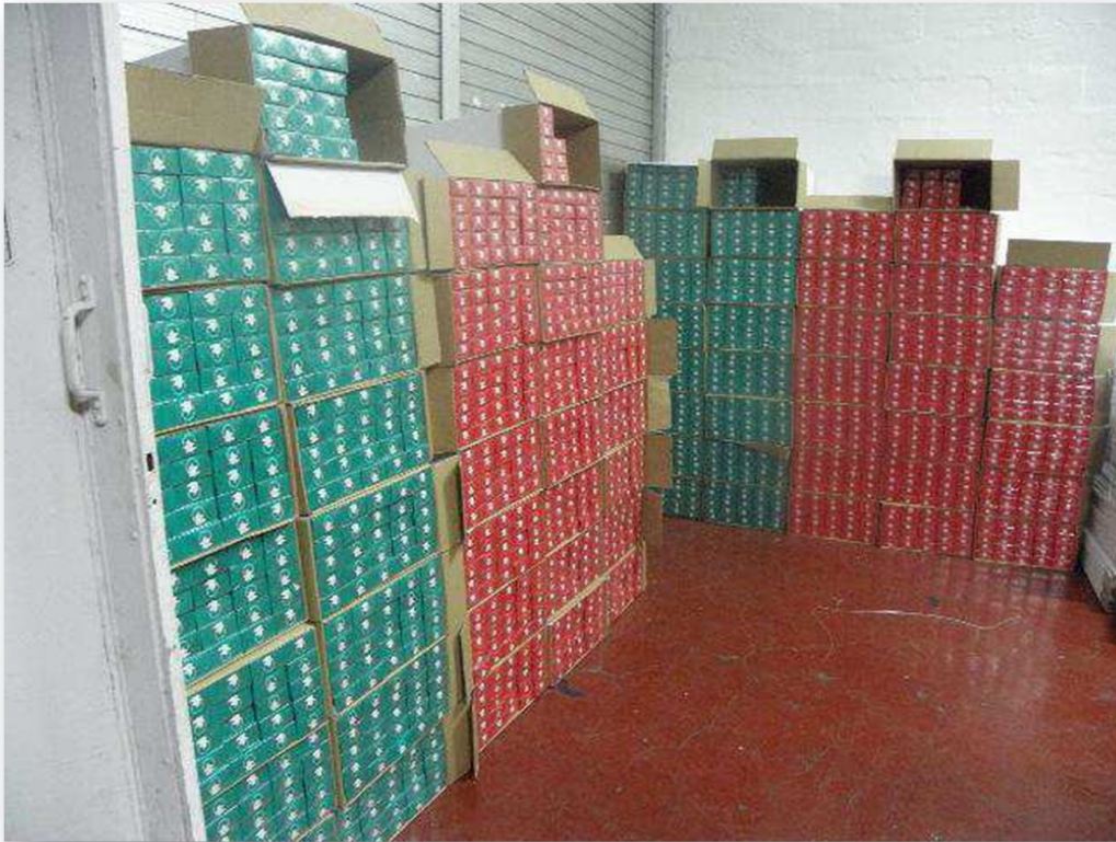
35,000 packets of contraband cigarettes of assorted brands were seized.