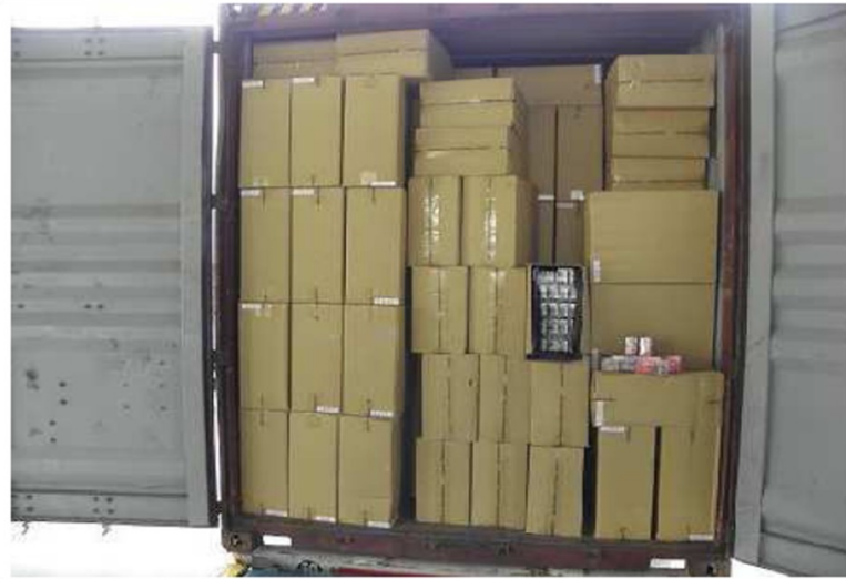
Cigarettes packed in brown boxes filled the container