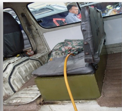
Modified the Fuel Tank