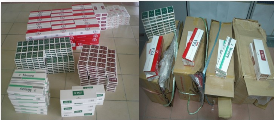
Total Quantity of the Cigarettes were 200 Cartons