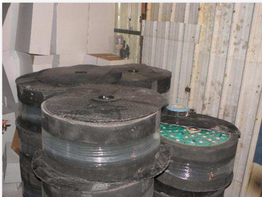
Inside each drum, the cover load of rubber sheets made up the first layer.