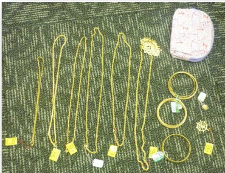
The jewellery found in the pouch